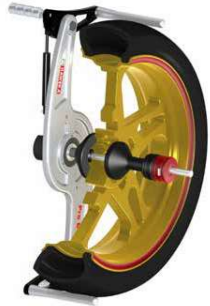
Application of the ProBike.